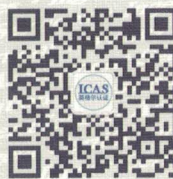
Focus on icas WeChat platform

Add: Room 801, HuaDing Mansion, 2368# West Zhongshan Rd., Xuhui District, Shanghai, China, 200235