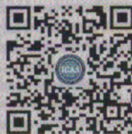
Focus on icas WeChat platform

Add: Room 801,HuaDing Mansion, 2368# West Zhongshan Rd., Xuhui District, Shanghai, China, 200235.